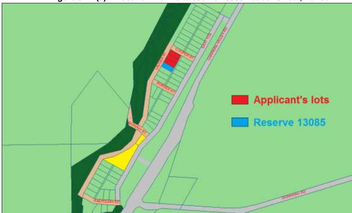
Figure 9.1.1(a) – Location Plan for Reserve 13085 Lauder Street, Nanson

A lease agreement for a Crown Reserve within the Nanson townsite has now expired and Council has received a further request from the landowner of the adjoining properties, T Jeffery of Lots 40, 41 and 42 Lauder Street, Nanson, seeking to continue the grazing lease agreement. This report makes recommendation that a new agreement be entered into with the previous lessee for the use of Reserve 13085 Lauder Street, Nanson.