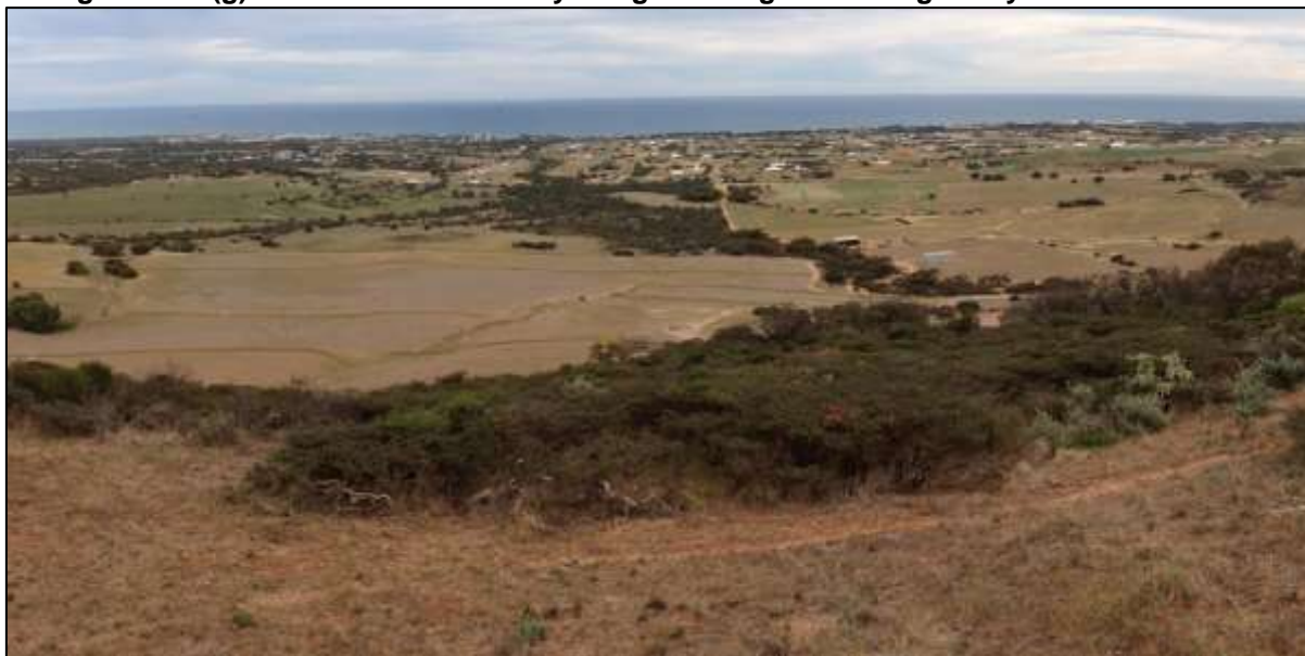
Figure 9.1.2(g) – View on the Moresby Range looking west along Dolby Creek to the ocean