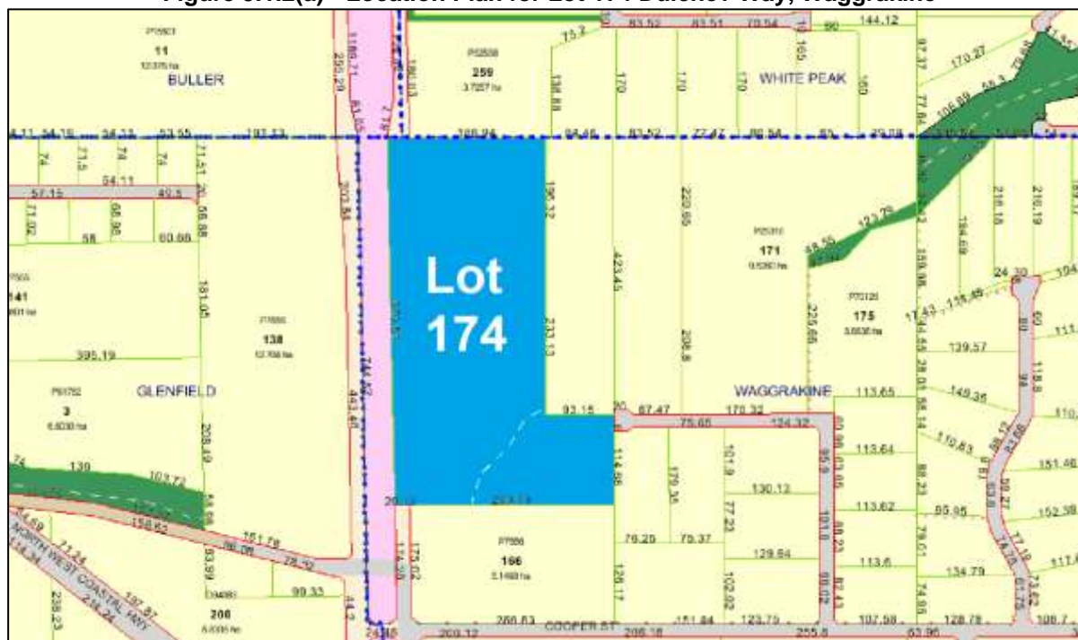
Figure 9.1.2(a) - Location Plan for Lot 174 Dulchev Way, Waggrakine

The applicant proposes to subdivide Lot 174 by creating a 11.335ha balance lot on the northern side of Dolby Creek that would contain the existing residence and outbuilding and continue to gain access via Dulchev Way.