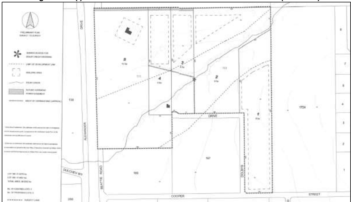
Figure 9.1.2(f) – Scheme Amendment No.24 Subdivision Guide Plan (24/5/2000)

Amendment No.24 to Scheme No.1 was given Ministerial approval on 24 May 2000 and rezoned the lots on the northern side of Dolbys Drive from 'General Farming' to 'Special Rural' leading to the subdivision pattern for Lots 170-174 (with Lot 170 having been further subdivided since). The Scheme Amendment No.24 documentation contained a Subdivision Guide Plan that illustrated Lot 174 in its current size.