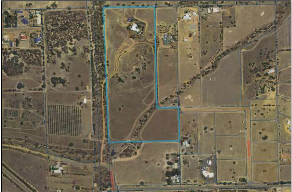
Figure 9.1.2(b) – Aerial photograph of Lot 174 Dulchev Way, Waggrakine

It is proposed that the rear (western) boundary alignment of the 2 new lots to front Dolbys Drive would be identified on-site at survey stage with representatives of the Department of Water and the Shire in attendance. The establishment of this alignment would ultimately determine the foreshore reserve width ahead of when subsequent subdivision of the balance lot creates the Dolby Creek foreshore reserve.