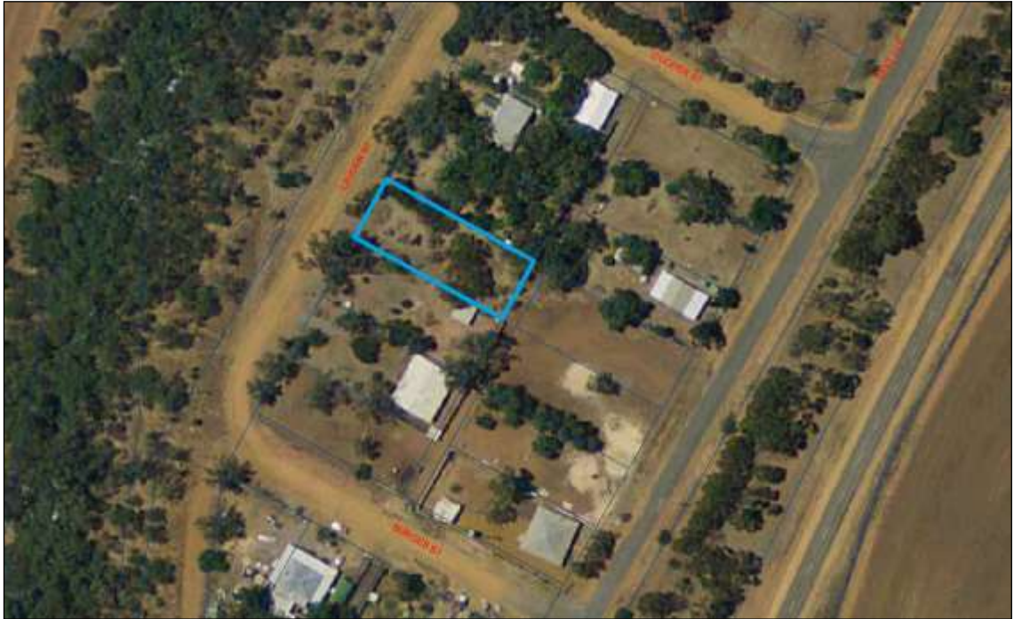
Figure 9.1.1(b) – Aerial photograph of Reserve 13085 Lauder Street, Nanson

The site is undeveloped and the Shire has no current plans to develop the land parcel for recreational purposes.