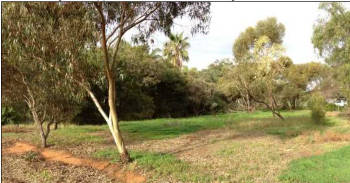
Figure 9.1.1(c) – View of Reserve 13085 looking east from Lauder Street

It is recommended that a new lease agreement should be drafted as per the previous lease agreements, that is for a period of five (5) years with an annual fee of $1.00 on demand (sometimes referred to as a ‘peppercorn’ lease). A draft lease agreement has been included as Attachment 9.1.1(a) with this report for Council’s consideration.