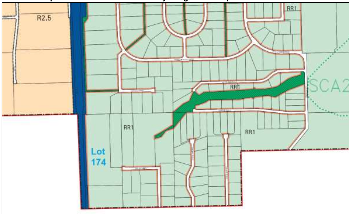
Figure 9.1.2(e) – extract from the Scheme Map illustrating the location of Lot 174 in context to the section of the Dolby Creek corridor that has already been created and the Special Control Area 2 - Moresby Range Landscape Protection Area zone

Section 5.19 of the Scheme lists the following requirements for the Rural Residential zone considered relevant to the assessment of this subdivision application: