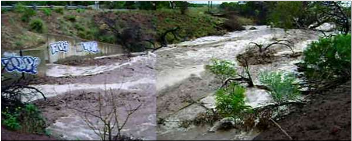
Figure 9.1.2(h) – Dolby Creek during 1 in 200 year rainfall event