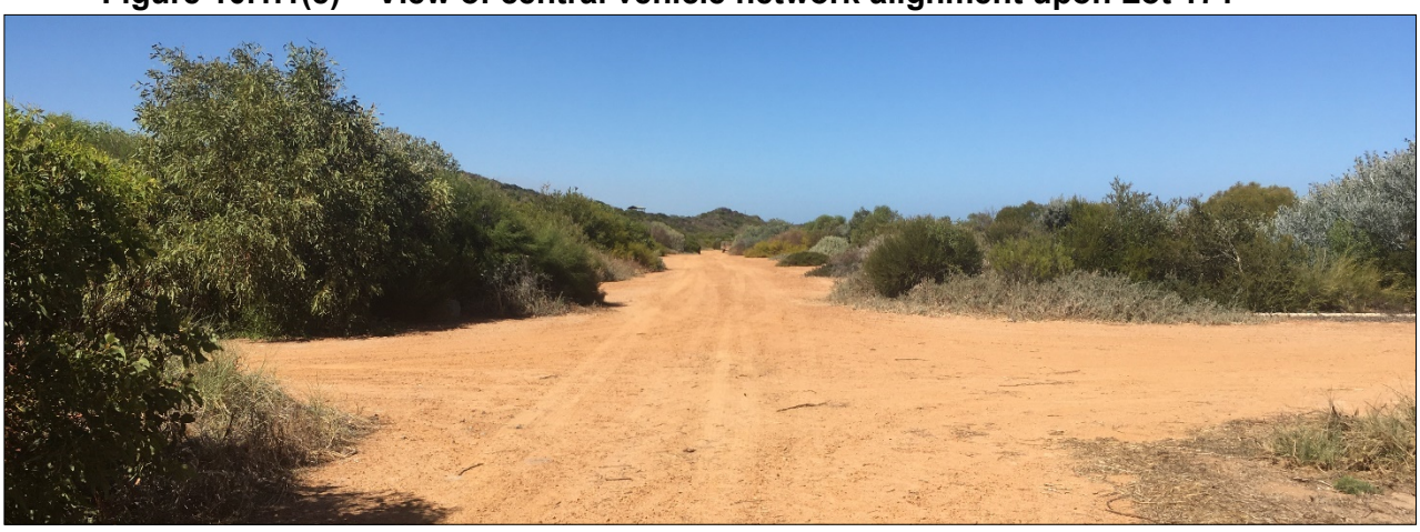
Figure 10.1.1(e) – View of central vehicle network alignment upon Lot 171