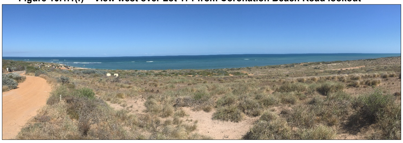
Figure 10.1.1(f) - View west over Lot 171 from Coronation Beach Road lookout