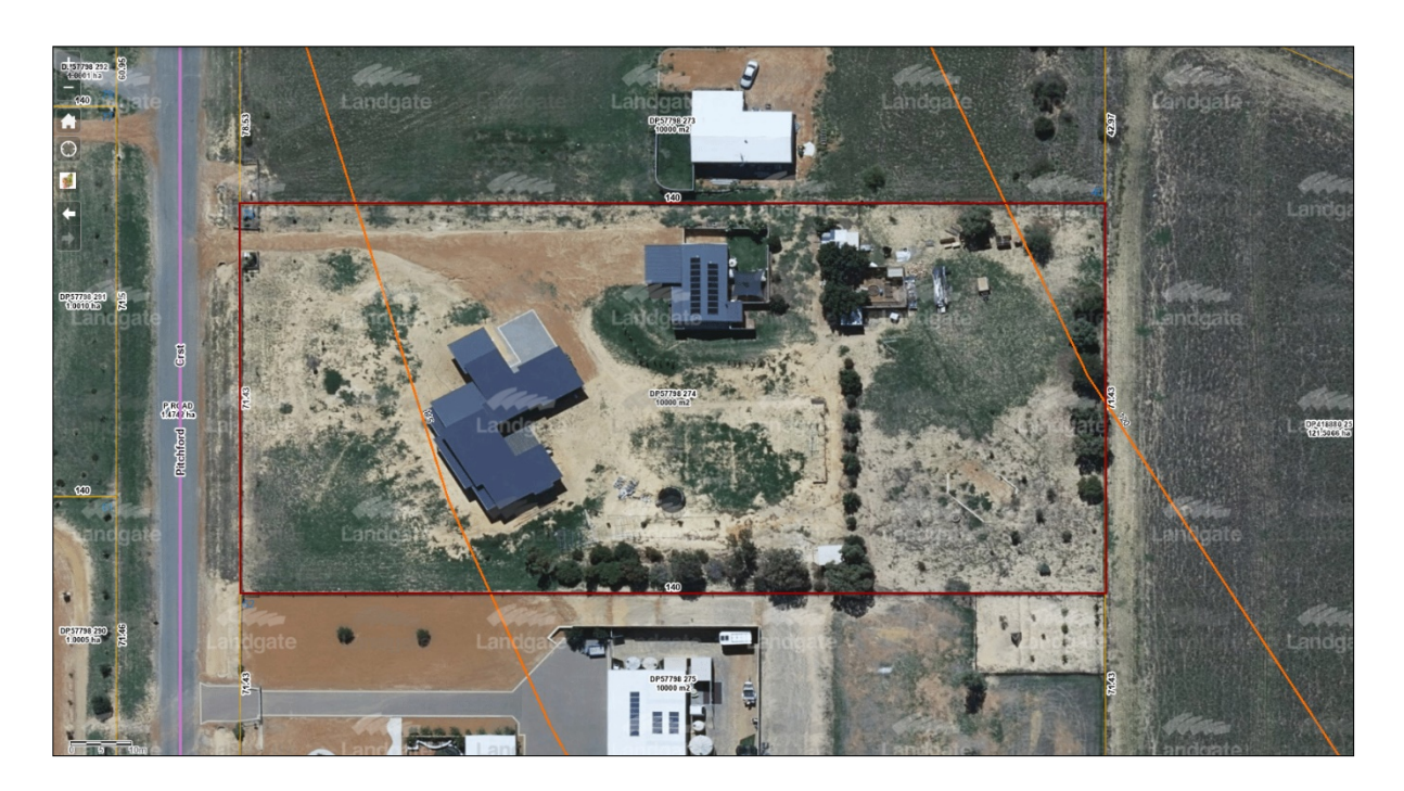
Figure 10.1.2(c) – View looking east from road along Lot 274 side property boundary