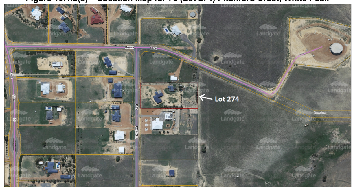
Figure 10.1.2(a) - Location Map for 76 (Lot 274) Pitchford Crest, White Peak

Lot 274 is a 1ha property that contains a single storey residence and outbuilding and slopes downwards from the 120m contour at the rear (eastern end of the property) to the 115m contour towards the front (west) of the property.