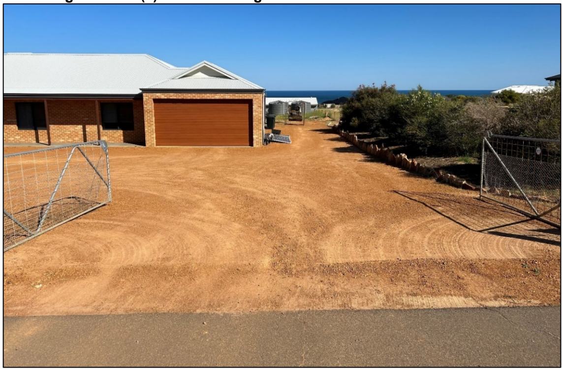
Figure 10.1.1(c) – View looking west at Lot 115 from Richards Road