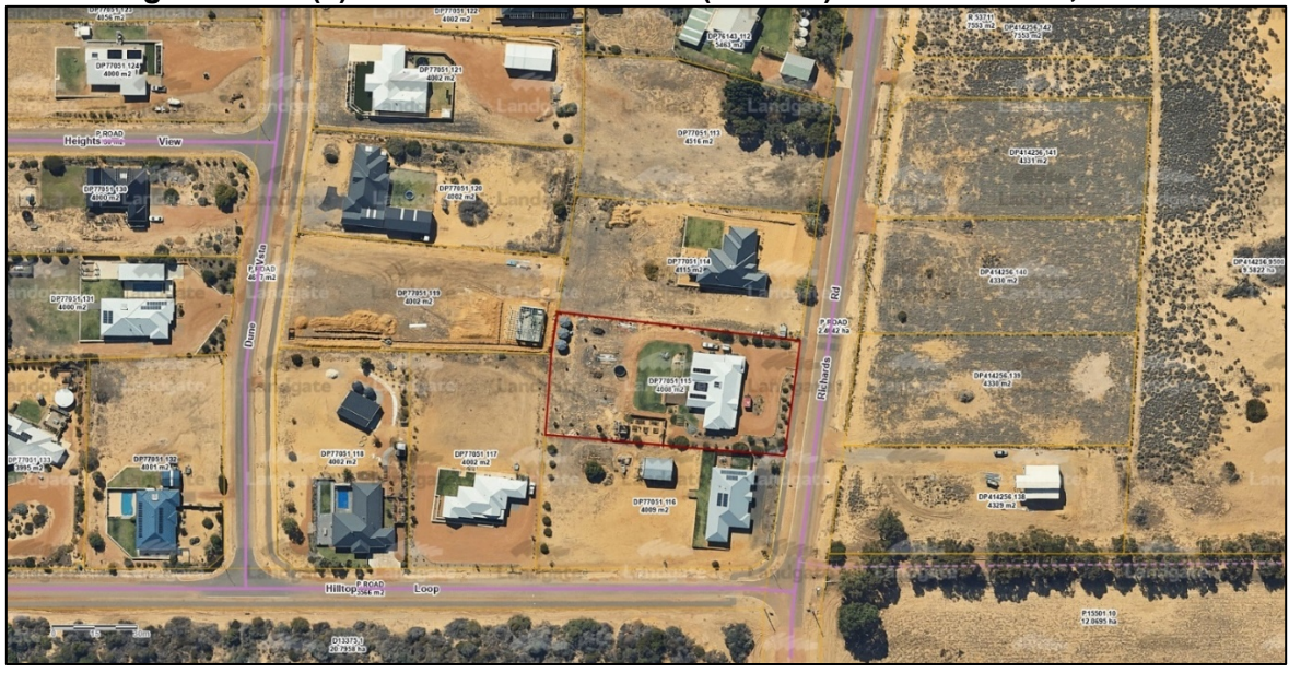
Figure 10.1.1(a) – Location Plan for 27 (Lot 115) Richards Road, Buller