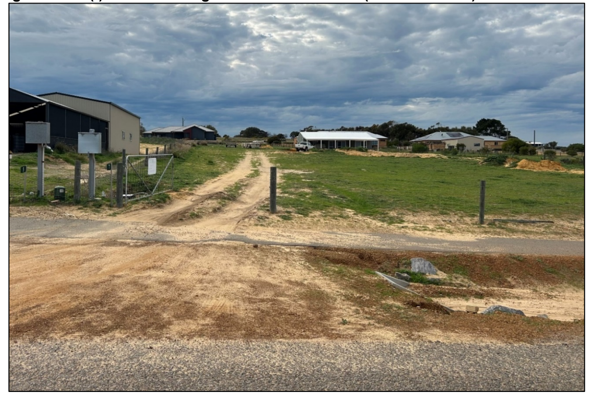
Figure 10.1.1(f) – View looking east towards Lot 115 (across Lot 119) from Dune Vista