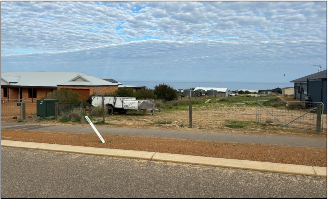
Figure 10.1.1(d) – View looking south-west towards Lot 115 (across Lot 114) from Richards Road