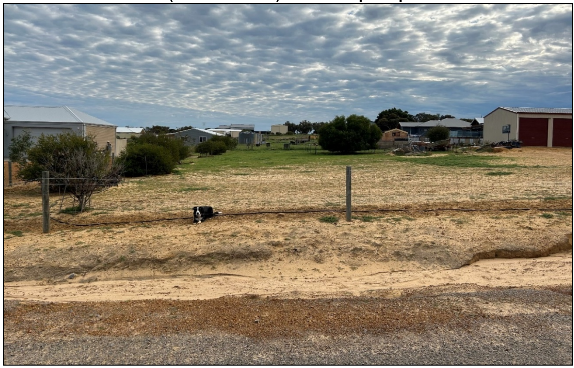
Figure 10.1.1(e) – View looking north towards Lot 115 (across Lot 116) from Hilltop Loop