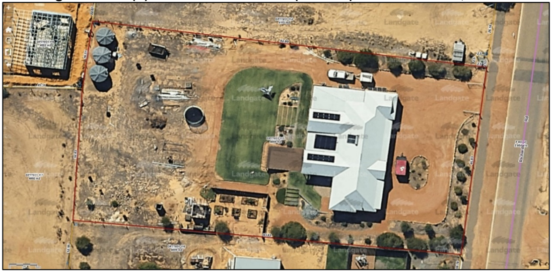
Figure 10.1.1(b) – Aerial Photo of 27 (Lot 115) Richards Road, Buller

Lot 115 is a 4,008m<sup>2</sup> property on the western side of Richards Road in the Wokarena Heights Estate that contains a single storey brick walled, colorbond roof residence. The property slopes down from the 51.5m contour in the north-east corner to the 47.5m contour in the south-western corner.